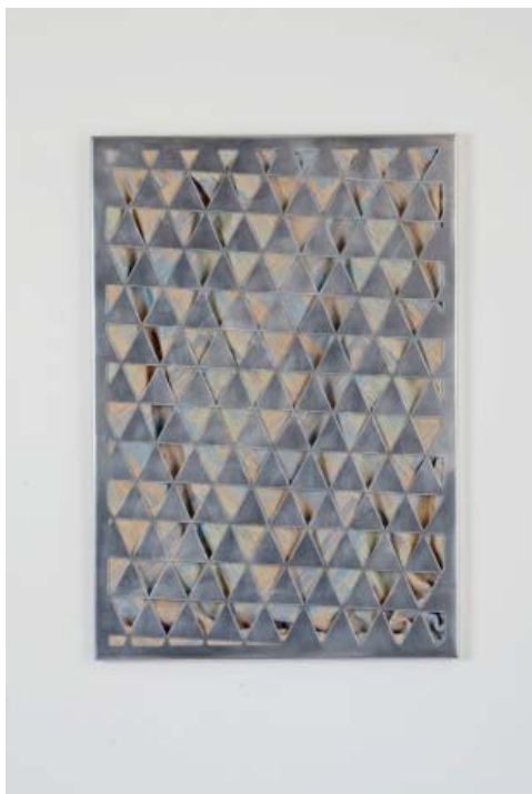
Lucas Lenglet, cut up, 2010 aluminium and woven cotton, 70 x 100 x 3 cm