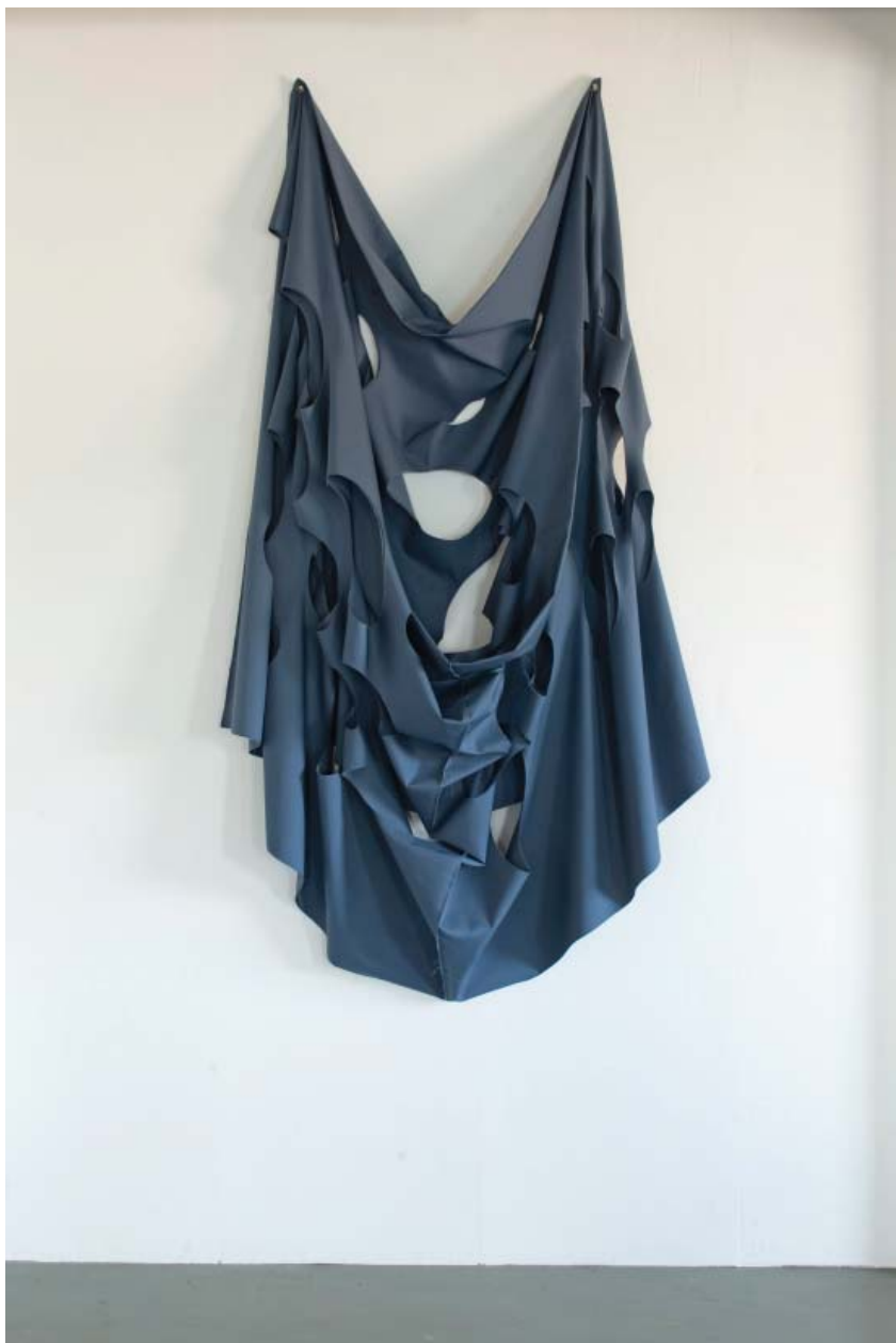
Lucas Lenglet, "Best of Both" (blue), 2010 cotton and polyester, messing rings, 180 x 80 x