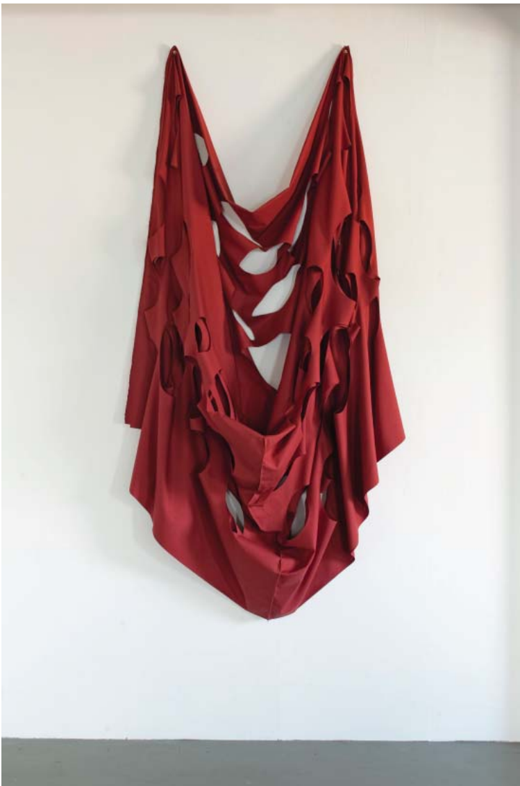
Lucas Lenglet, "Best of Both" (red), 2010 cotton and polyester, messing rings, 180 x 80 x 10 cm