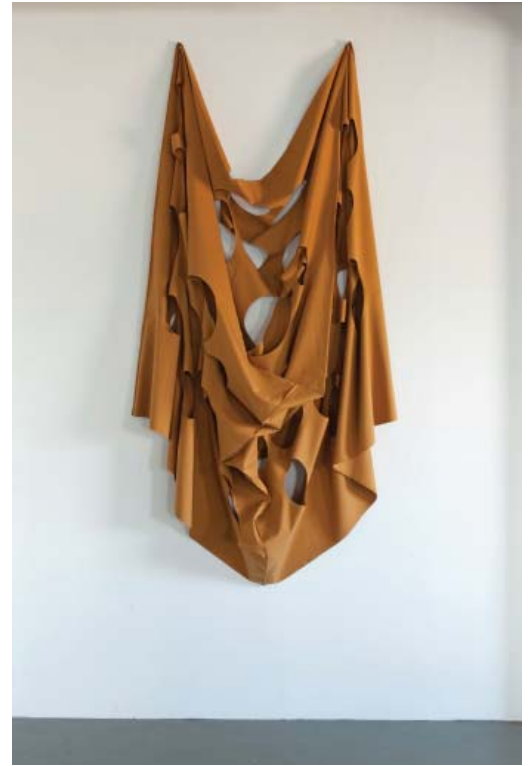
Lucas Lenglet, "Best of Both" (yellow), 2010 cotton and polyester, messing rings, 180 x 80 x