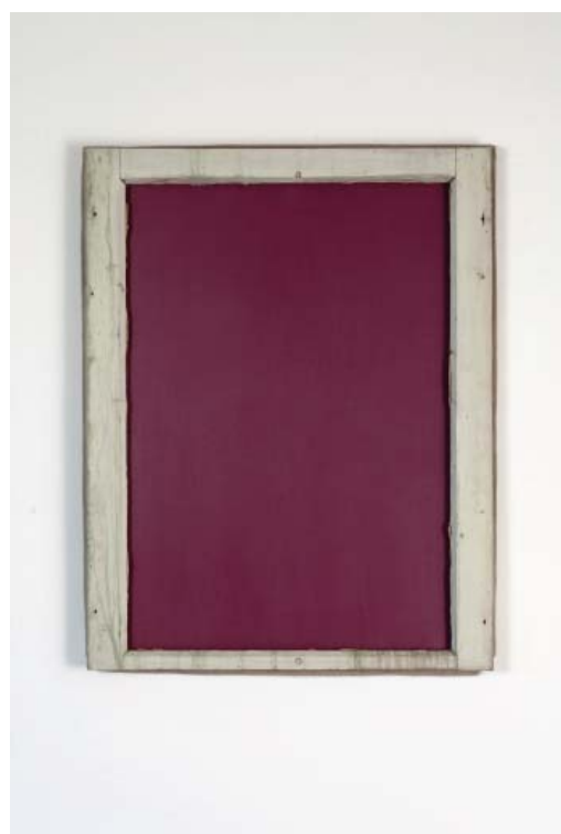
Lucas Lenglet, "Aperture" (rose), 2010 acrylic on linnen, used window, 76 x 98 x