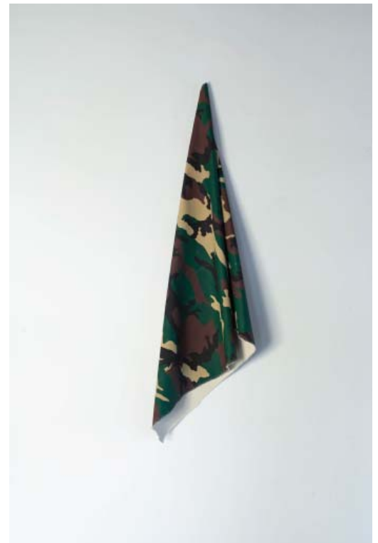
Lucas Lenglet, "What can I do that would be abstract but not really abstract?", 2010 acrylic on cotton