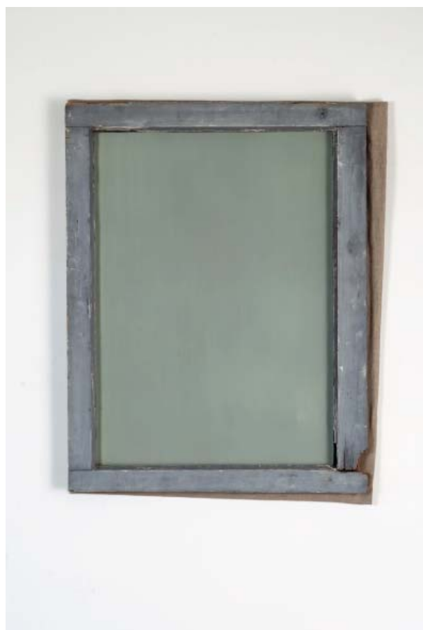
Lucas Lenglet, "Aperture" (grey), 2010 acrylic on linnen, used window, 73 x 97 x 4