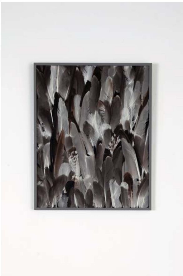
Lucas Lenglet, "And if it doesn't you don't", 2009 feathers in aluminium frame, 41,2 x 51,2 x 1,8 cm