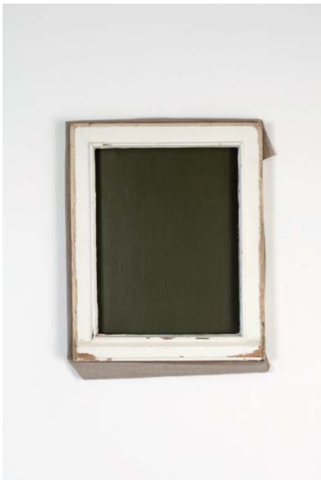
Lucas Lenglet, "Aperture" (olive), 2010 acrylic on linnen, used window, 78 x 63 x 6,5 cm