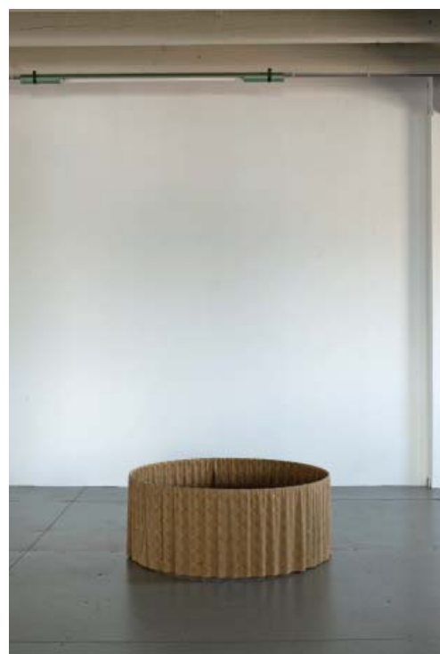
Lucas Lenglet, fantastic dimensions, 2010 lycra, spraypaint, metal ring Ø 100 x 40 cmcm