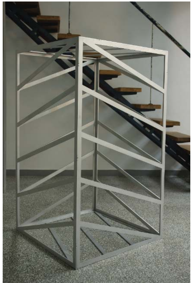
Lucas Lenglet, "Untitled, Cage", 2010 aluminium, 140 x 80 x 80 cm, edition 1 of 3, 1